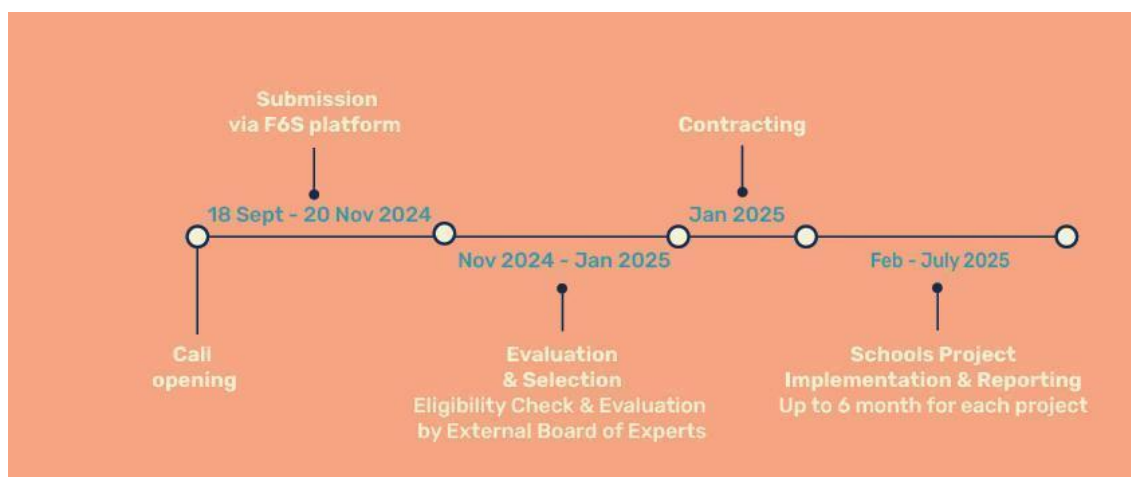
Figure 1: SHORE - Open Call #2 and follow-up overview

An overview of the SHORE - Open Call #2 can be found in Figure 1.