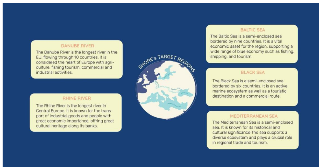
Figure 2: SHORE - Open Call #2 Target Areas