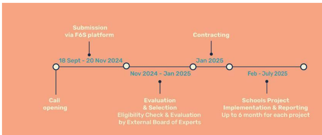
Figure 1: SHORE – Open Call #2 and follow-up overview

An overview of the SHORE – Open Call #2 can be found in Figure 1.